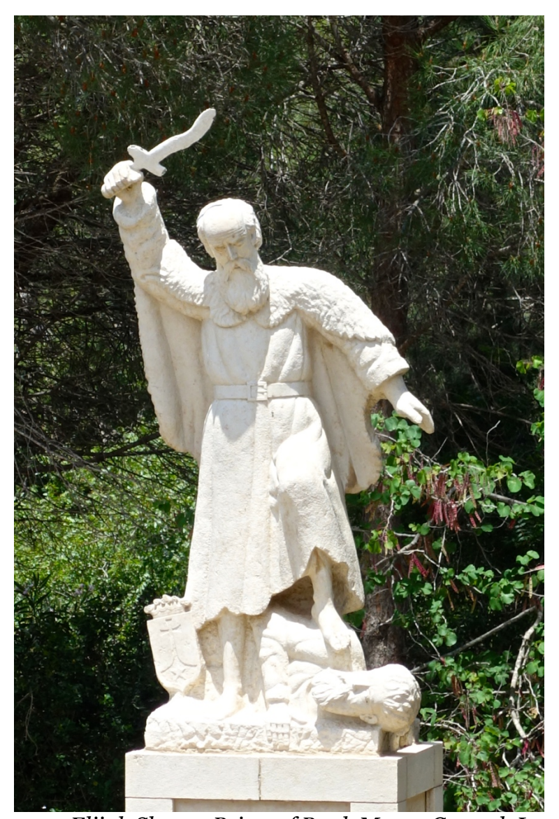
Figure 1. Elijah Slays a Priest of Baal, Mount Carmel, Israel<sup>2</sup>

An Old Testament KnoWhy1 relating to the reading assignment for Gospel Doctrine Lesson 28: "After the Fire a Still Small Voice (1 Kings 17-19) (JBOTL28A)